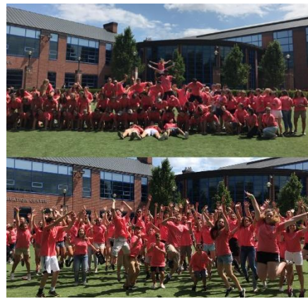
Stuebenville East Youth Conference 2017

*** Please enclose your company business card. ***