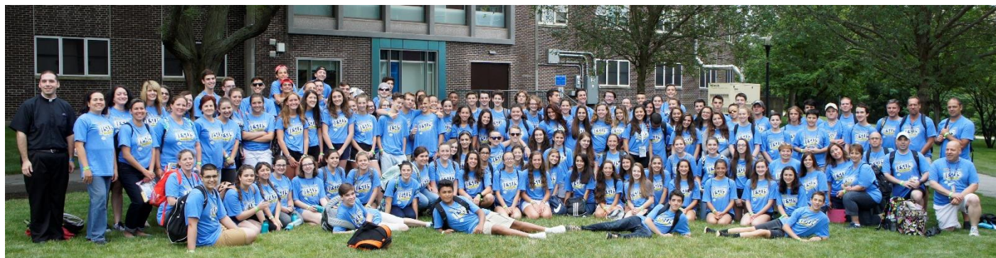
STEBENVILLE EAST 2017 – 109 YOUTH ATTENDEES

www.saintphilip.com ☩ E-mail: youth@saintphilip.com